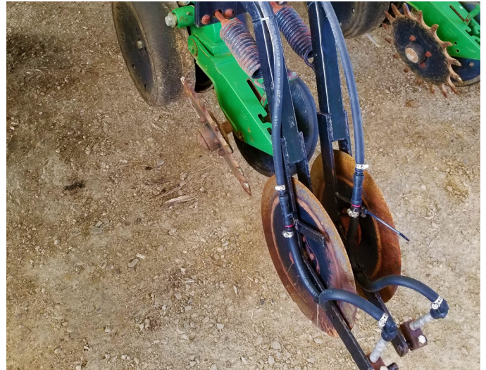
Figure 2. Starter fertilizer application system on row planter.