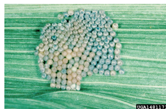
Figure 2. Egg mass of western bean cutworm just prior to hatch, note the purple color of eggs just prior to hatch, light colored eggs are infertile or parasitized.