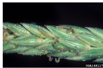
Figure 3. First instar larvae feeding on pollen and pollen sacs.