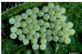
Figure 1. Newly deposited egg mass of western bean cutworm, note the bright white color.

Mature larvae feed on the ear tip and tunnel into the side of the ear to access the kernels. Larvae disperse from the plant where the eggs were deposited to infest neighboring plants, both within and across the row. After completing at least six growth stages in about 55 days, the larvae drop to the soil and burrow to create an earthen overwintering chamber. Depending on soil texture the overwintering chambers can be at a depth of 16 inches in course soil, but an average of about 8 inches across soil types. Winter