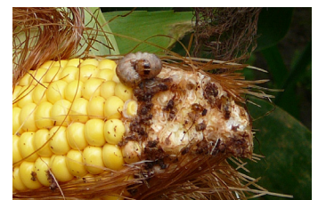
Figure 4. Western bean cutworm larvae, note the brown bands behind the head. The bands are only present on later larval growth stages