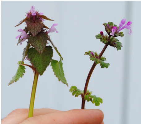
Figure 7. Purple deadnettle (left) and henbit (right) look similar and can be misidentified. They can be distinguished from each other by looking at the leaves in the upper portions of the stem. The upper leaves of purple deadnettle have short petioles that attach to the stem while henbit leaves attach directly to the stem.