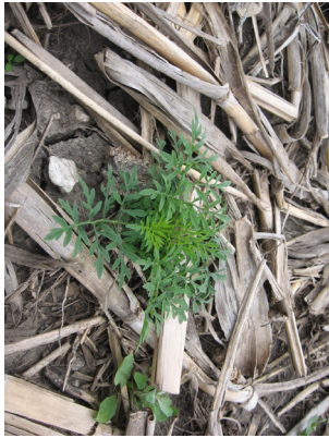
Figure 13. Common ragweed seedling. Triangular shaped leaves that are finely divided and hairy. First leaves are opposite; however, later leaves are alternate. Mature plants can reach heights of 6 feet.