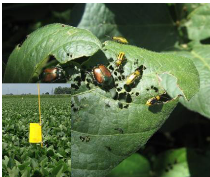
Figure 22. Western corn rootworm variant beetles and Japanese beetles feeding on soybean leaves. Insert shows a rootworm trapping device to measure rootworm infestation level.