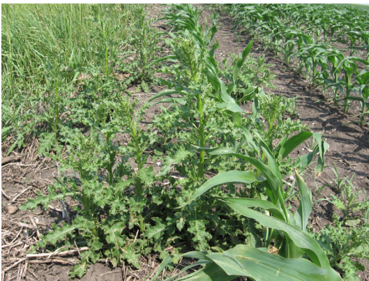
Figure 17. Canada thistle. As a perennial, growth usually begins in the spring, but new seeds may germinate in the fall and go dormant until spring. The weed spreads by a creeping root system. 9