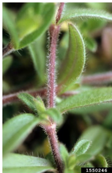
Figure 3. Mouseear chickweed leaves are dark green, elongated, and covered with soft hairs.