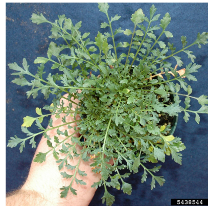
Figure 18. Virginia pepperweed rosette. An annual that emerges in early spring. Rosette leaves are hairless, lobed on both sides, lanceolate or linear, and without petioles. 9