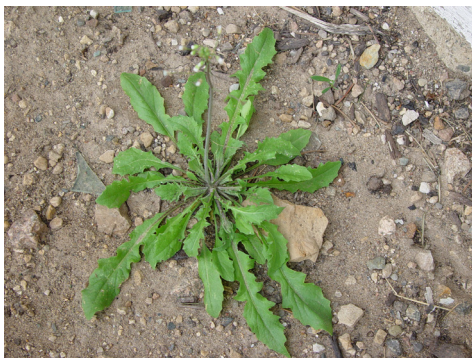
Figure 9. Shepherd's-purse rosette. Leaves are alternate, deeply toothed, and smooth or hairy. 9