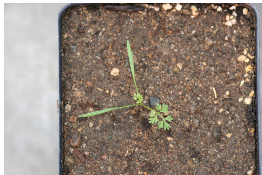
Figure 10. Wild carrot seedling. A biennial that is a rosette the first year before elongating the second year. Second-year stems are green with bristly hair and leaves are hairy. 9