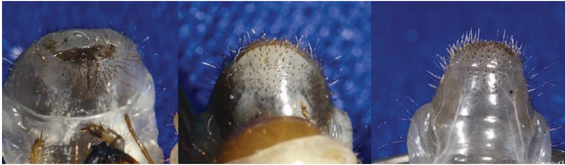
Figure 19. True white grubs (June beetle adult) feed on plant roots. Severe feeding can cause plant wilting and death. True white grubs are potentially the most damaging in corn because they survive in the larval form for three years. Other grubs that can be found include chafer beetle larvae (L), Japanese beetle larvae (C), and June beetle larvae (R). The different species can be identified by the arrangement of hair on the tail.