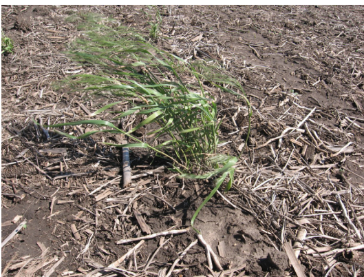
Figure 5. Downy Brome. Seedlings are light green with soft hairs on the leaf sheath and blades. Distinguished by twisted leaves and long, awned spikelets.