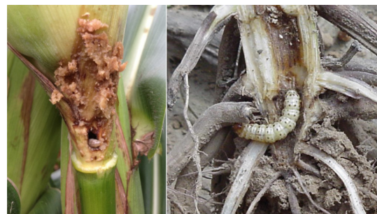
Figure 23. European corn borer larva in ear shank (L) and southwestern corn borer larva feeding in base of corn plant (R). The adult moths emerge from overwintering pupae and lay eggs on corn leaves. As the eggs hatch, the larvae initially feed on leaf tissue before boring into stalk tissue. European corn borers can be found throughout the plant while southwestern corn borers migrate to the lower stalk and root. Having knowledge of feeding in continuous corn operations can allow for proactive management for future corn crops.