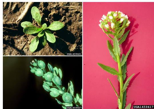
Figure 6. Field pennycress emerges as a rosette (top left), has hairless leaves attached directly to the stem with no petiole (right), and penny-shaped seeds (bottom left).