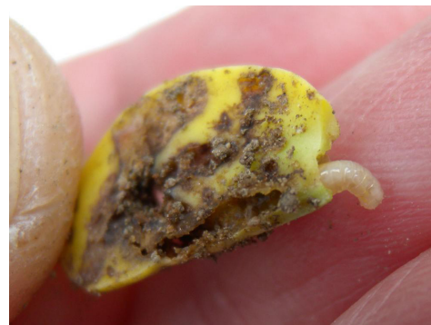
Figure 21. Seedcorn maggot. Larvae may be present in fields with terminated crop residue or fields treated with manure because the adult flies are attracted to the residue and lay eggs in the residue.