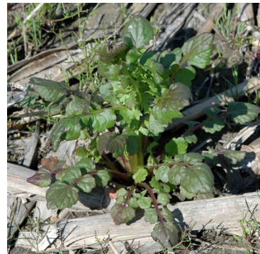
Figure 16. Cressleaf groundsel rosette. Cressleaf groundsel (aster family) germinates in the fall and develops a rosette. The basal rosette leaves are deep pinnate serrations with roundly lobed leaf margins. The stems of bolted plants are hollow. Flowers are yellow with six to twelve rays. 8