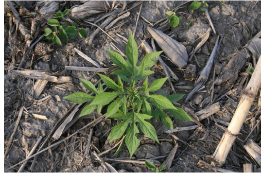
Figure 14. Young giant ragweed. Cotyledons are round to paddle shaped and the stem is shiny and green with purple spots. Mature plants are usually 3 to 12 feet tall. Stems are single or branched with short hair. Leaves can be 12 inches long and 8 inches wide and are opposite.