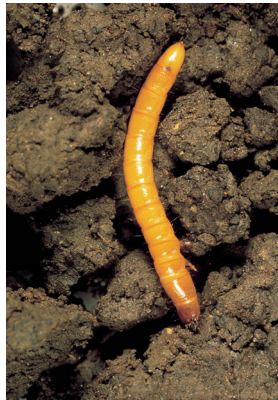
Figure 20. Wireworms live for several years in the soil and feed upon seedling corn plants by boring into the lower stem killing or severely damaging the growing point. Damaged seedlings may show center leaves being wilted or dead (dead heart) and have excessive tillering.