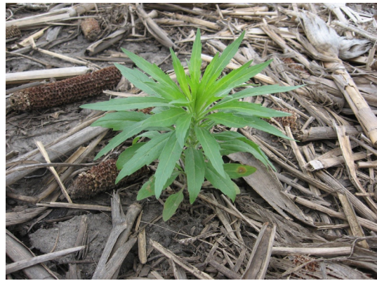
Figure 8. Marestalk or horseweed forms a basal rosette after germination and seedlings are covered with coarse hair and have toothed leaf margins. Mature plants develop an erect, columnar shape and flowers are white to pink with yellow centers. Marestalk is more susceptible to an herbicide application when in the rosette stage. It is important to control marestalk before it is more than 4-inches tall.