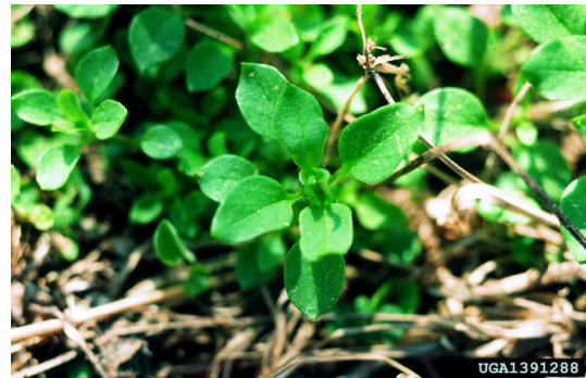
Figure 2. Common chickweed leaves are bright green, nearly rounded with pointed tips, and nearly hairless. The stem has a single straight row of hair.