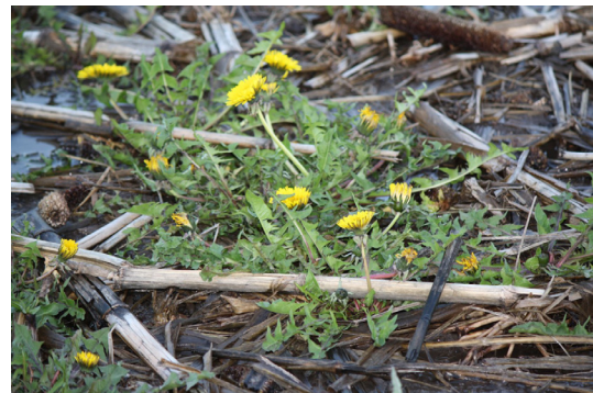
Figure 4. Dandelion leaves form points toward the center of the rosette and all plant parts exude a milky sap when broken.