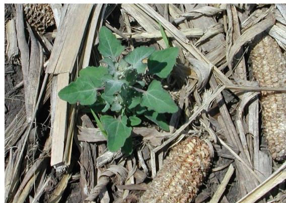
Figure 12. Common lambsquarters germinates before corn planting with leaves covered with a powdery coating. Leaves form an opposite pattern and plants can grow almost six feet tall. Some lambsquarters may be resistant to ALS-inhibitor and Photosystem II inhibitor herbicides. There may also be reduced sensitivity to glyphosate. 4