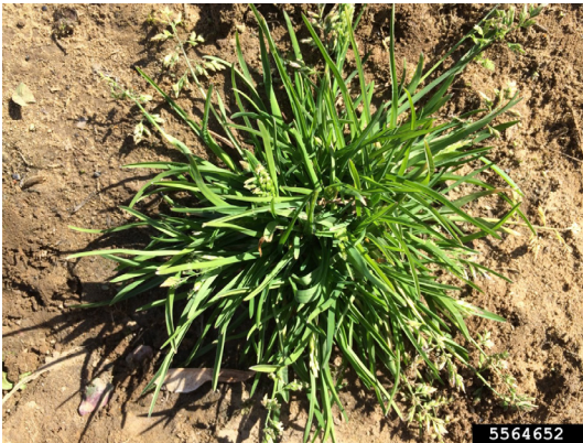
Figure 1. Annual bluegrass. Shallow-rooted grass that often roots at lower nodes and flowers by crop planting. 5