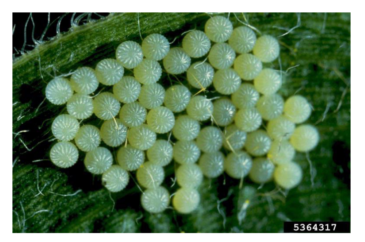
Figure 1. Newly deposited egg mass laid by a western bean cutworm. Note the bright white color.

There is a single generation per year. Larvae overwinter in the soil and moths can emerge as early as June and last until September, but the peak emergence period is mid-July. The adult moth is an active flier at night and can be found resting in the whorl of corn during the day. Females can oviposit up to 600 eggs over their life, and the average lifetime production is about 380 eggs. The female deposits eggs on the upper surface of corn leaves during vegetative growth stages, and after tasseling the switches to laying eggs on the leaves closest to the ear or on the ear itself. Newly deposited eggs are bright white and barrel-shaped, and laid with an average of about 50 eggs per mass (Figure 1). Prior to hatching, the eggs become purple (Figure 2), which is caused by the color of the head capsule of the larvae showing through the eggshell. Depending on temperature, egg hatch can occur five to seven days after oviposition.