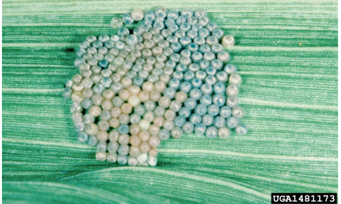
Figure 2. Egg mass laid by a western bean cutworm, just prior to hatch. Note the purple color; light-colored eggs are infertile or parasitized.