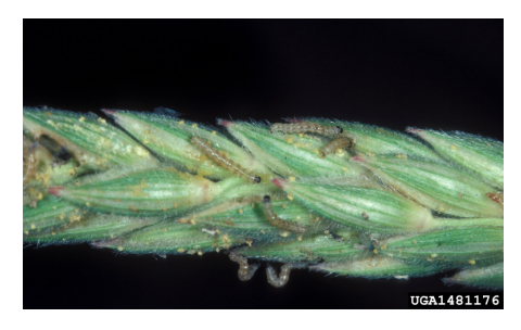
Figure 3. First instar larvae feeding on pollen and pollen sacs.

Mature larvae feed on the ear tip and tunnel into the side of the ear to access the kernels. Larvae disperse from the plant where the eggs were deposited to infest neighboring plants, both within and across the row. After completing at least six growth stages in about 55 days, the larvae drop to the soil and burrow to create an earthen overwintering chamber. Depending on soil texture the overwintering chambers can be at a depth of 16 inches in coarse soil, but on average are found about 8 inches deep across soil types. Winter mortality rates under natural conditions are about 60%, with higher rates of survival in coarse-textured soils.