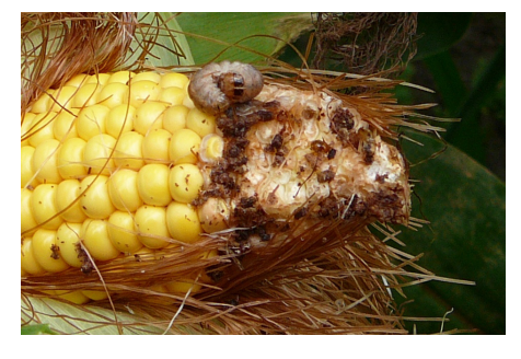
Figure 4. Western bean cutworm larvae; note the brown bands behind the head. The bands are only present on later larval growth stages.