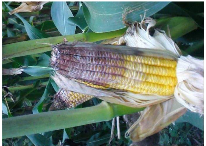
Figure 5. Gibberella ear rot.

Gibberella ear rot ( Gibberella zeae ): The coloration is often bright pink, but it varies from red to white. Gibberella ear rot usually begins at the ear tip and progresses toward the base (Figure 5). Ears become “mummified” because the pink or white mycelial growth completely covers the ear and causes kernels to stick to husks and cobs. Favorable conditions for the development of Gibberella ear rot include cool temperatures and wet weather within three weeks after silking. 4 Potential mycotoxins include vomitoxin, also known as deoxynivalenol (DON), and zearalenone, which may cause sickness or death in livestock. 7