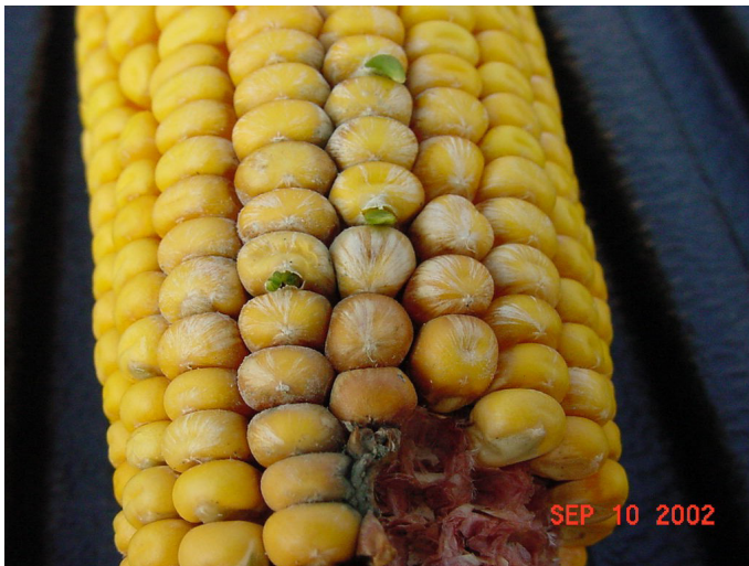
Figure 4. Fusarium ear rot.

Fusarium ear rot ( Fusarium species ): A white to pink mold which infects random kernels around the ear, and which may cause a starburst pattern on kernel caps (Figure 4). Fusarium infection may occur from late vegetative growth stages to three weeks after mid silk. 3 Fusarium can infect a kernel through growth cracks or damage, such as that from insects, hail, or other mechanical injuries. Warm, wet weather after silking favors development of Fusarium ear rot. Fusarium can produce the mycotoxins zearalenone; fumonisin, which is toxic to livestock, particularly horses; and vomitoxin, also known as deoxynivalenol (DON). 6,7