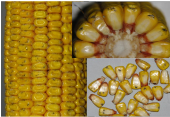
Figure 2. Cladosporium kernel rot.

Cladosporium kernel rot ( Cladosporium herbarum ): A gray to black or very-dark-green powdery mold that may appear in streaks scattered across the ear (Figure 2). The mold can be rubbed off the kernel surface. Infected kernels are often those damaged by insects, hail, frost, and other factors. The disease is favored by wet weather during grain fill. However, it is more common in hot, dry years. C. herbarum can grow at temperatures greater than 90 °F and grain moisture content as low as 16%. 5