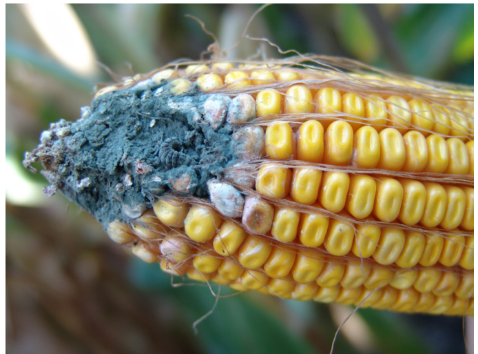
Figure 8. Penicillium ear rot.

Penicillium ear rot or “Blue Eye” ( Penicillium species): A powdery blue-green mold which grows between kernels, usually at the tip of the ear (Figure 8). Infection generally occurs on kernels damaged by hail, insects, frost, or other factors, though Penicillium is capable of infecting non-injured kernels with 14% moisture content. 3 Penicillium is an important grain storage mold. Affected grain should be dried to 13 to 15% moisture content, depending on storage duration, to prevent further damage. 8 These fungi can produce mycotoxins. 7