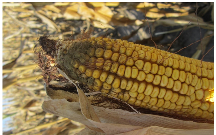
Figure 1. Aspergillus ear rot.

Aspergillus ear rot ( Aspergillus species ): A gray-green or light-green powdery mold starting at the ear tip (Figure 1). Development is favored by hot, dry conditions after damage to silks or kernels from insects, hail, birds, or other factors. Aspergillus can be a grain-storage mold and an issue in the field because of its ability to grow at 15% moisture content. 2,3 These fungi are capable of producing aflatoxin, a mycotoxin toxic to livestock and humans. Aflatoxin production increases with nitrogen stress and temperatures above 80 °F. 4 Fields with severe Aspergillus ear rot should be prioritized for earlier harvest with the grain being dried to below 15% moisture for harvest.