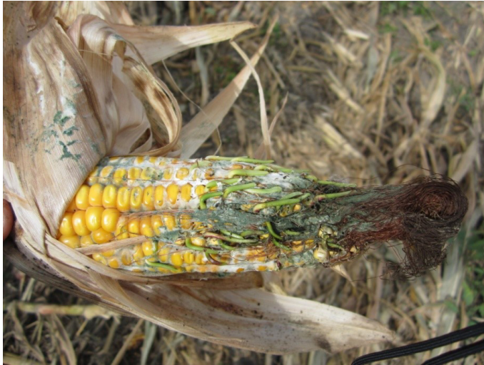
Figure 9. Trichoderma ear rot.

Trichoderma ear rot ( Trichoderma viride ): A dark-greenish mold which grows on and between husks and kernels. Sprouting can occur when the infection is severe (Figure 9). Trichoderma ear rot development is favored by excessive rainfall and damage from insects, hail, or other mechanical injuries to the ear. The disease occurs more often occurs when there is above-average rainfall the month before harvest. 3