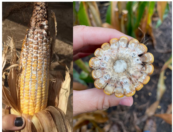
Figure 3. Diplodia ear rot with pycnidia observed in the kernels of cob on the right.

Diplodia ear rot ( Stenocarpella maydis ): A white to gray mold that can cause the entire ear to appear brown (Figure 3). Infection can begin at the ear base and move toward the tip, growing between kernels, but infection can also start at the tip of the ear, especially following insect or bird damage. Pycnidia, or fruiting bodies, can form on husks and at the base of kernels and can help in distinguishing Diplodia from other ear rots. Under severe infection, the ear may be entirely covered by white mycelium that, “mummifies” the ear and may cause the husk to stick to the kernels. Dead husks and ear leaves may be one of the first indications of Diplodia in the field. Cobs can also be infected via the ear shank, causing yield loss due to poorly developed ears and/or kernels. Diplodia ear rot occurs most often in reduced tillage and continuous corn systems. Development of this disease is favored by warm, dry conditions prior to silking followed by wet conditions after silking. S. maydis is not known to produce mycotoxins, but reports from other countries have associated this fungus with diplodiosis—a condition involving a lack of voluntary muscle coordination, muscle weakness, or partial paralysis—in cattle and sheep. 6