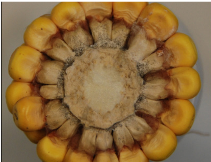
Figure 6. An ear infected with Nigrospora ear rot, showing black spores in the pith.

Nigrospora ear rot or cob rot ( Nigrospora sphaerica , synonym N. oryzae ): Infected kernel tips and cob pith can be covered with very small, jet-black spore masses (Figure 6). Kernels appear bleached, often have whitish streaks starting at the tips and extending toward the crowns, and may have a gray mold growth. Infected ears are easily broken into small pieces during harvest because of the rotted pith (Figure 7). Infection usually starts at the ear butt. This infection is often associated with premature plant death from frost, hail, or drought, and from leaf, stalk, and root diseases. The disease may appear more often in low fertility situations. 4